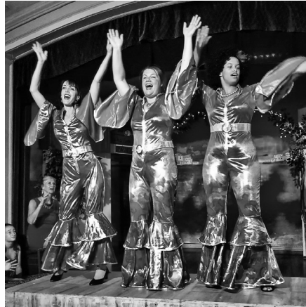
Mamma Mia stars did not have to social distance last summer.

One of the greatest parts of community theater is “being a part of the creative process of making theater, whatever form that takes.” And that requires people both on and off stage. Please join this historical group and be a part of the special comradery, unique to community theater, that goes back in Annisquam more than 150 years.